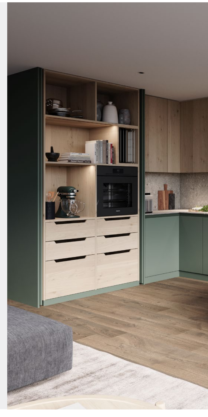
Open layouts awaken the desire for a smooth transition from the kitchen to the living area.

This is all based on technology that is just as invisible as a kitchen that is currently not in use.